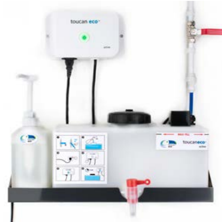
Chlorine Output Chart/ Solution Performance